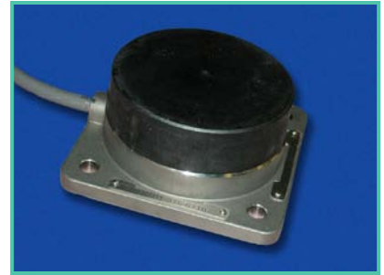
1 1/2 INCH